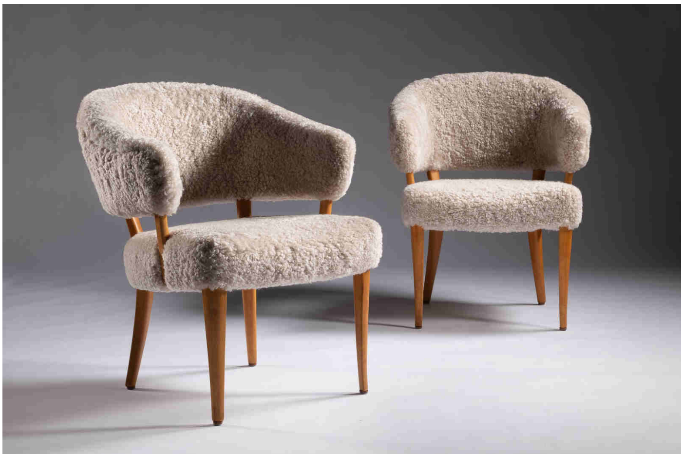
Pair of Carl Malmsten armchairs - Agneau curly Avoine

Pair of "Lata Greven" Carl Malmsten armchairs