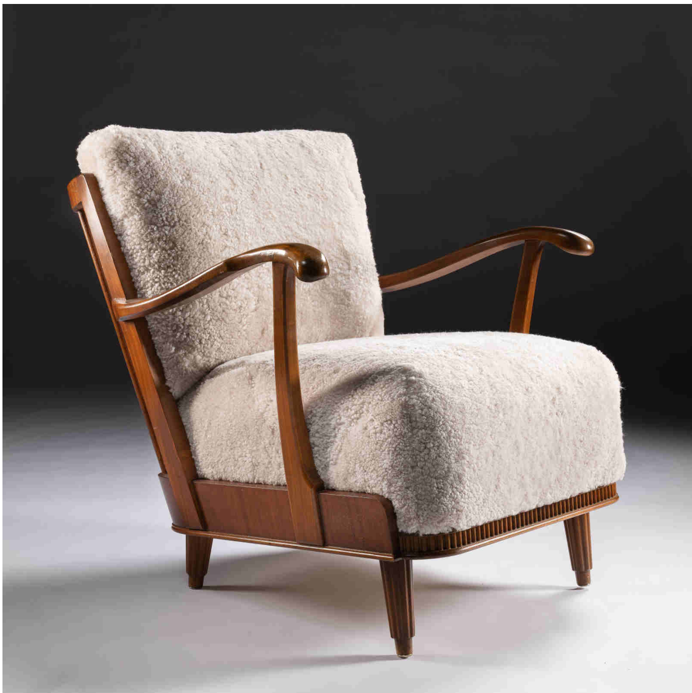
Svante SKOGH armchair - Agneau curly Avoine