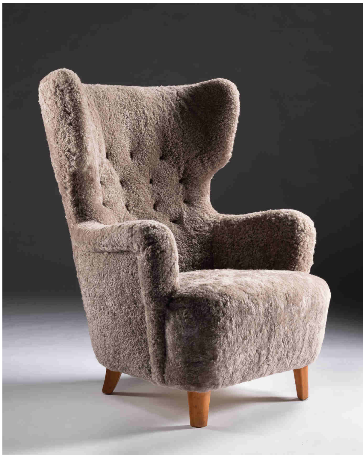
Dux armchairs - Agneau curly Sable