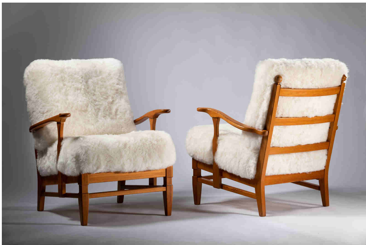
Paire de fauteuils ARE – Recouvrement mouton rasé 5 cm – Structure en pin Sheared sheepskin upholstery – Pine legs and arms