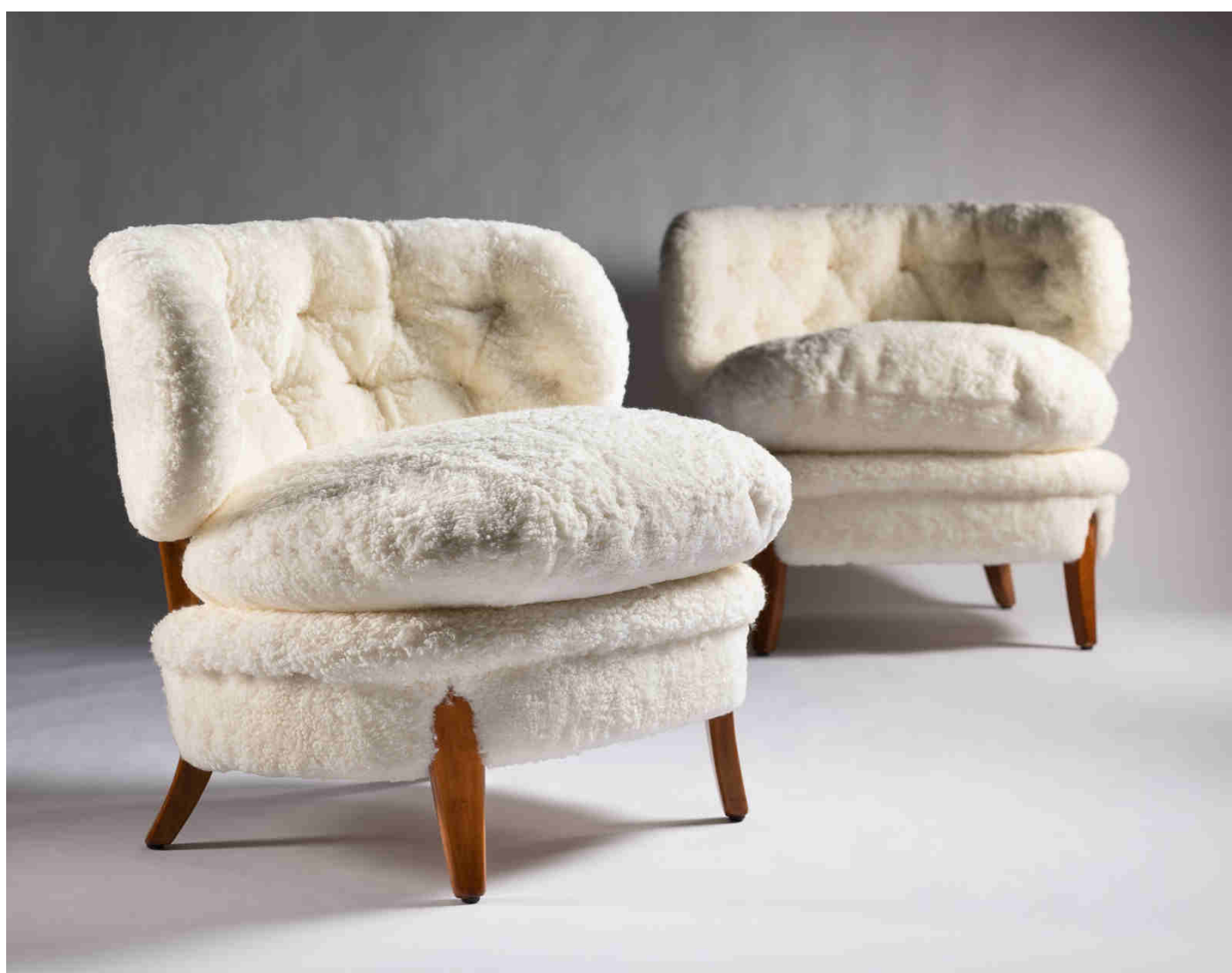
Pair of Otto Schultz armchairs - Agneau curly Naturel blanc