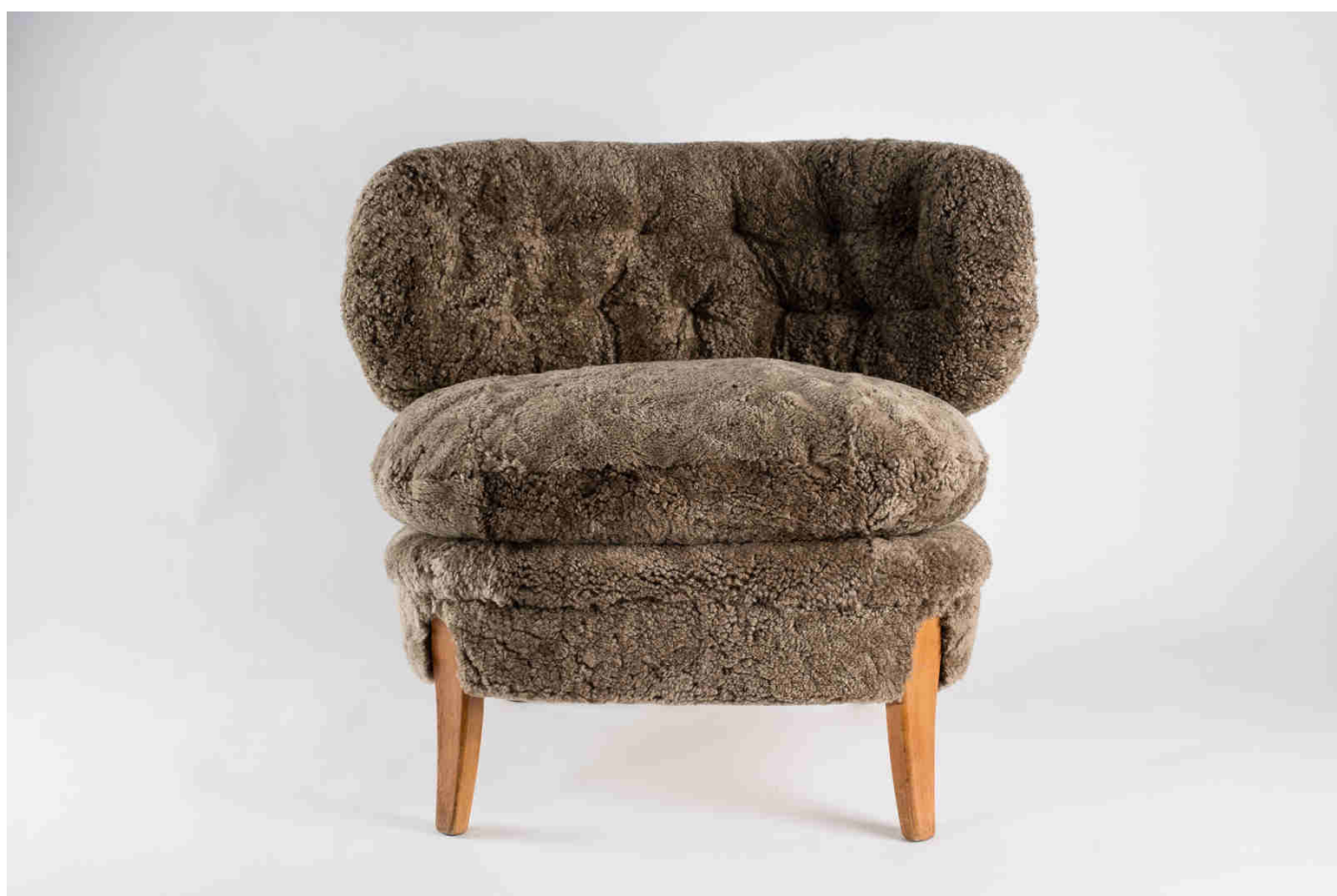
Pair of Otto Schultz armchairs - Agneau curly Sable