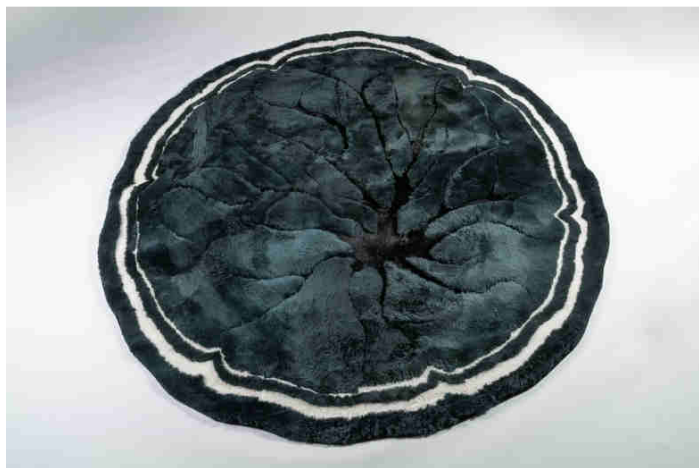
Roots – Bottle green, black and white shearling