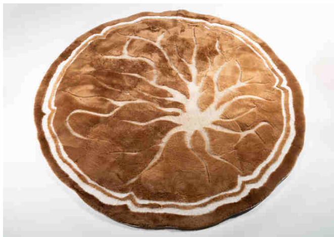
Roots – Camel, beige and white shearling