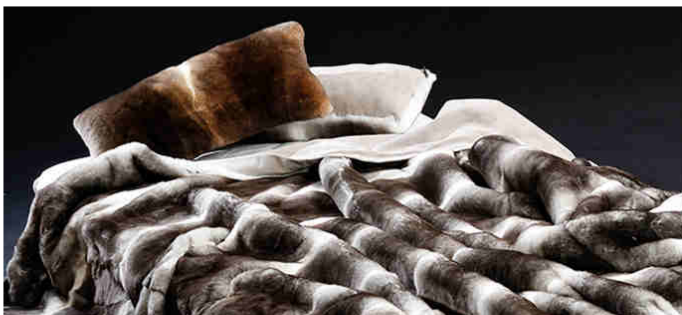
Coussins et plaids en oryrag – Orylag cushions and throw