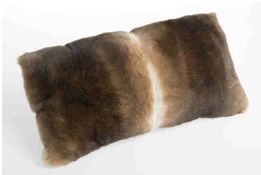
Coussin en oryrag 25x55 cm – Orylag cushion 0,82x1,80ft