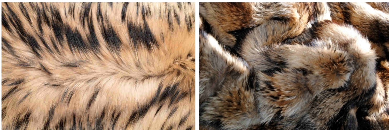
Plaid en finnraccoon naturel – Natural finnraccoon throw