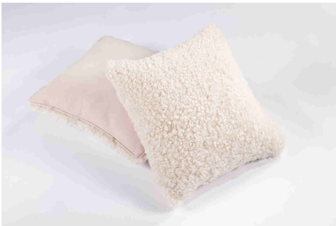
Coussins agneau curly Perle de culture – Fond et passepoil Perle de Culture curly shearling cushions – one side and piping in velvet leather