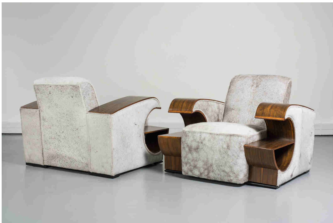
Paire de fauteuils 1920/1930 – Recouvrement poulain – Pieds en bois plaqué Horse hide upholstery – Wooden legs