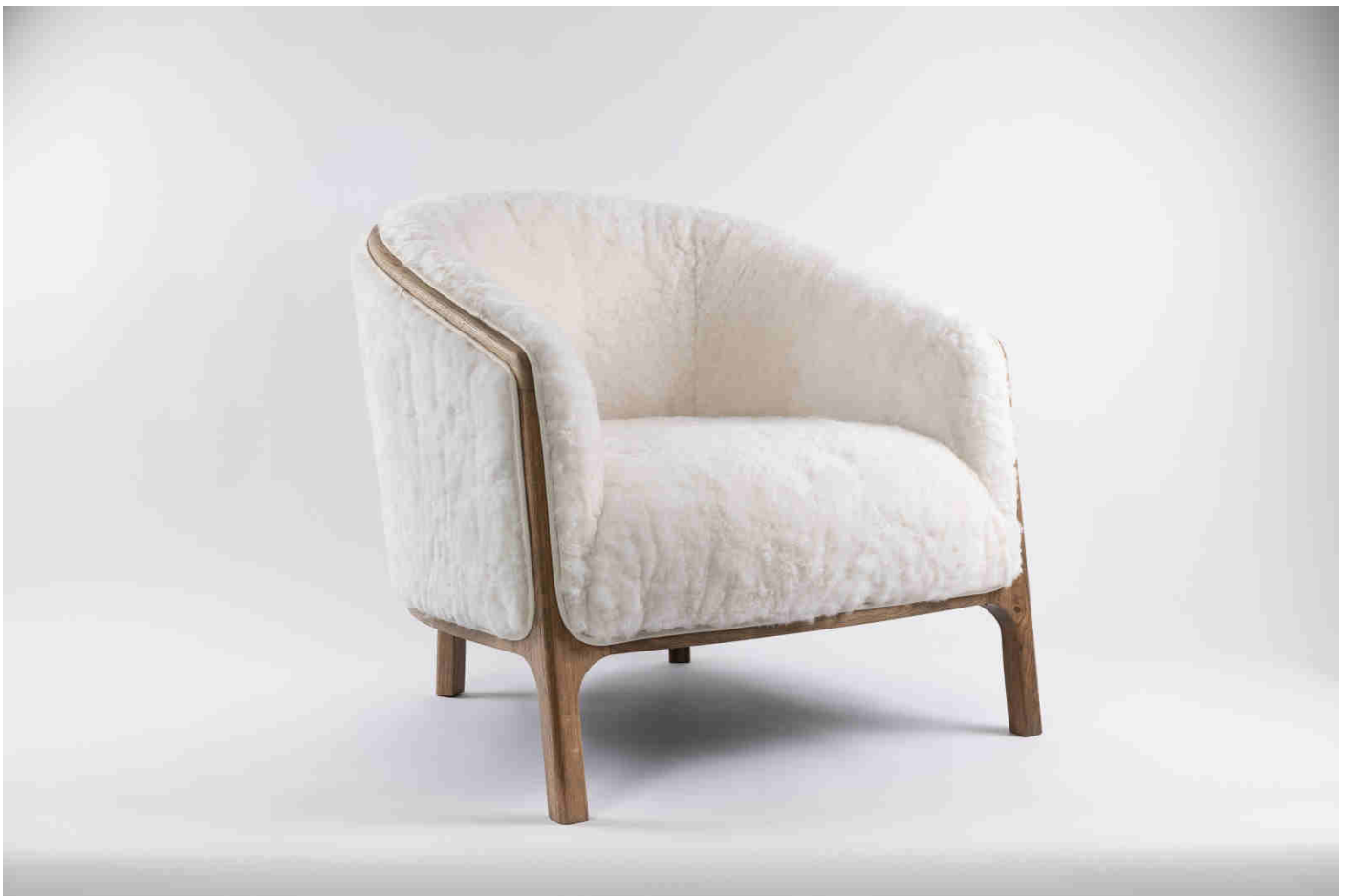
Osaka – Agneau rasé blanc 18 mm – pieds et accoudoirs chêne massif Natural white shearling / 18 mm hairs height – Solid oak legs and arms