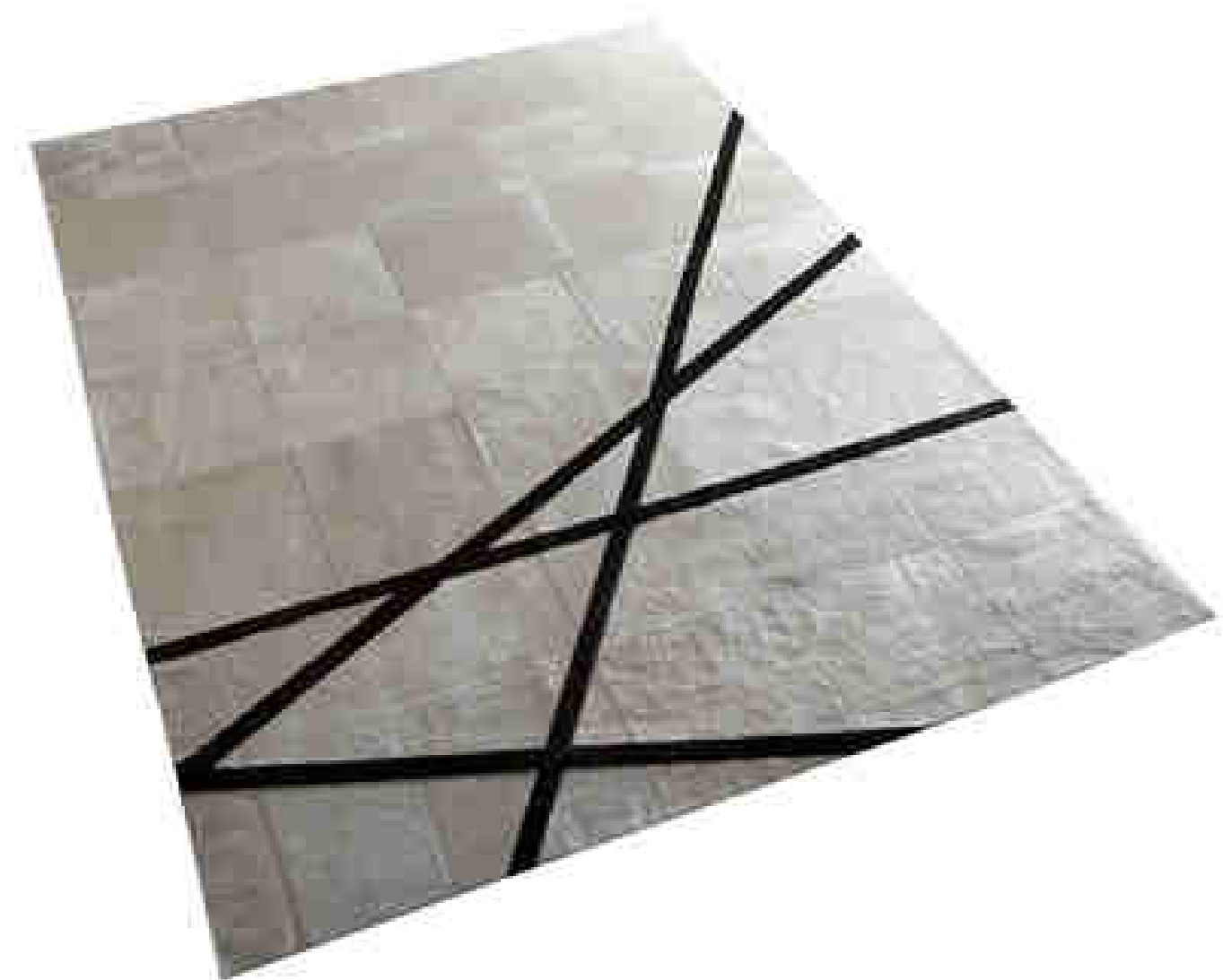
Tapis 200x280 cm (Rug 6,6x9,2ft)