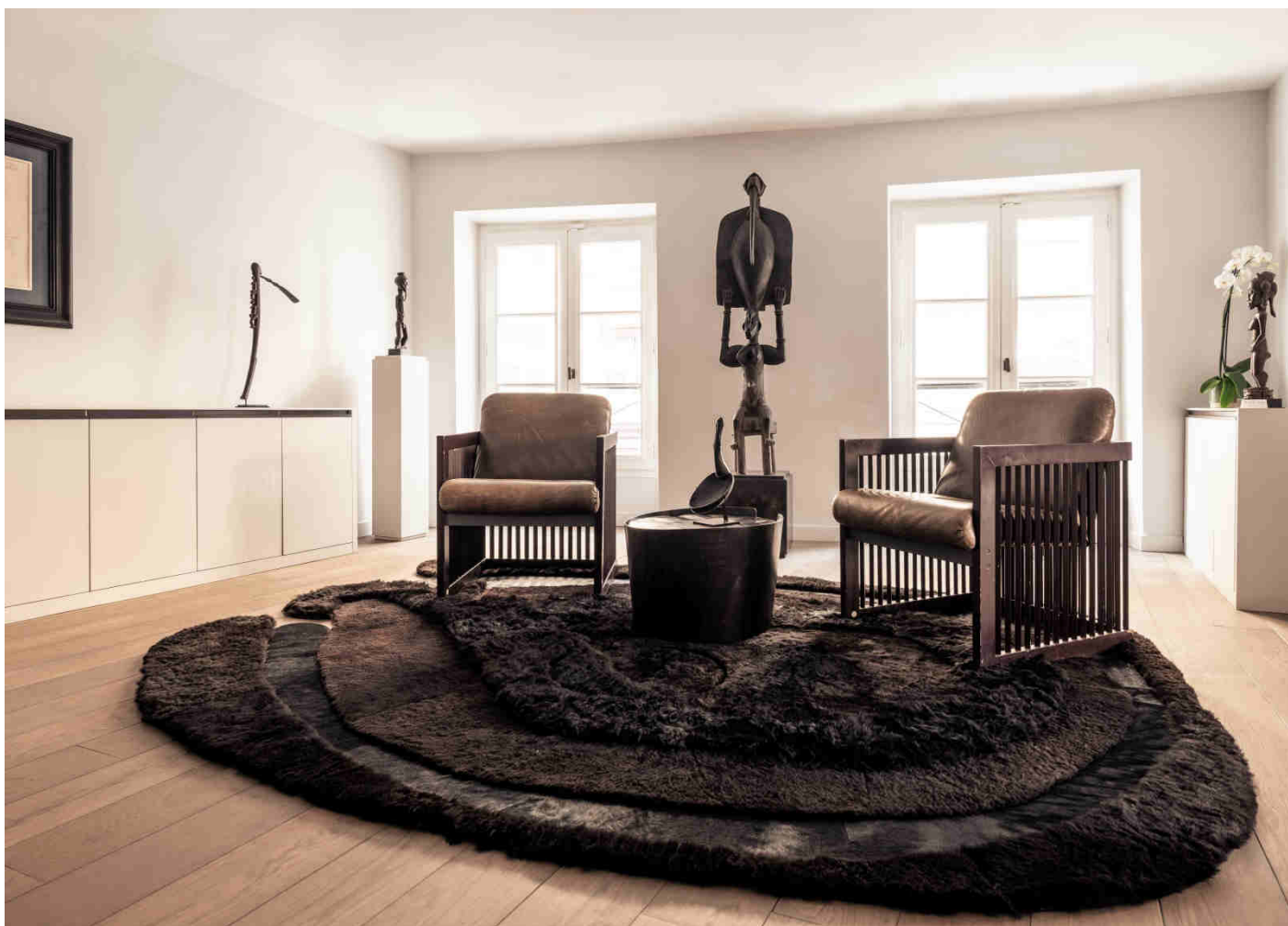
Tapis 220x300 cm (Rug 7,2 x 9,8ft)