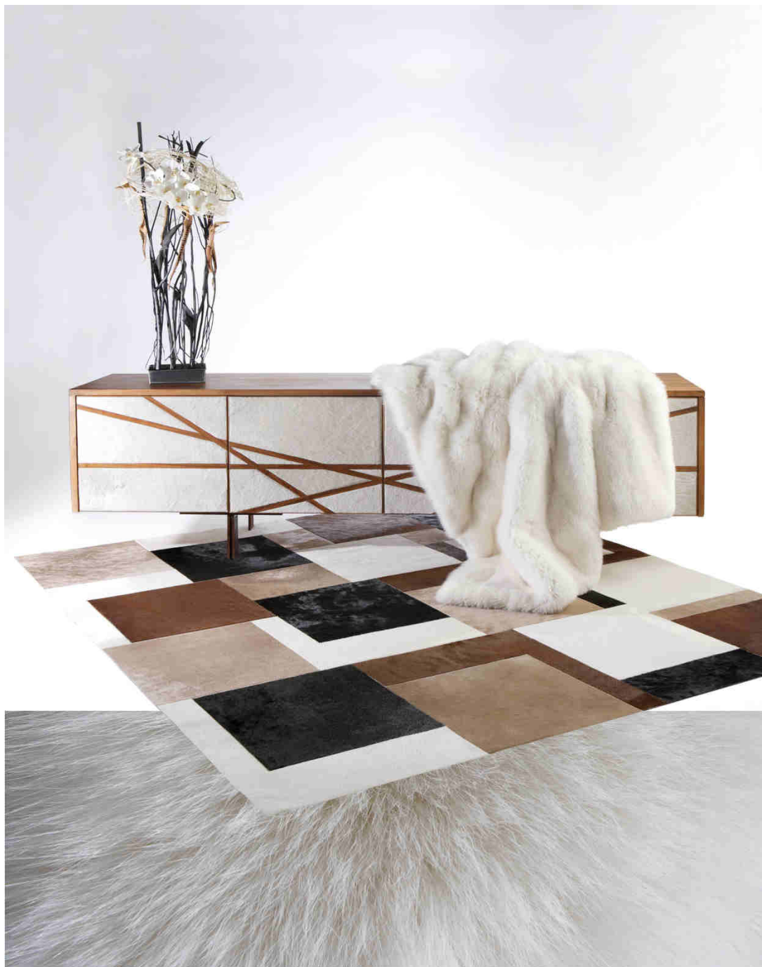
Tapis 220x240 cm (Rug 7,2 x 7,8ft)