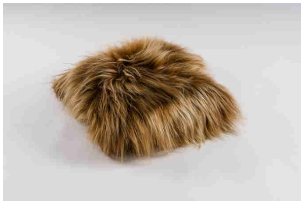
Coussin 45x45 cm – Doré poils longs et blanc poils 5 cm / Cushion 1,48x1,48ft – Golden long hairs and white 5 cm hairs