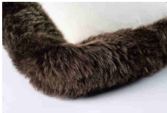
Coussins sur-mesure – Tissus et bords mouton / Custom cushions – fabric and sheepskin