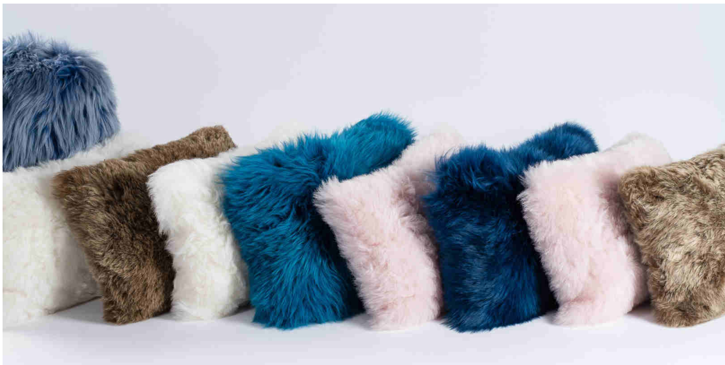
Coussins en mouton 30x65 cm – Sheepskin cushions 0,98x2,13ft