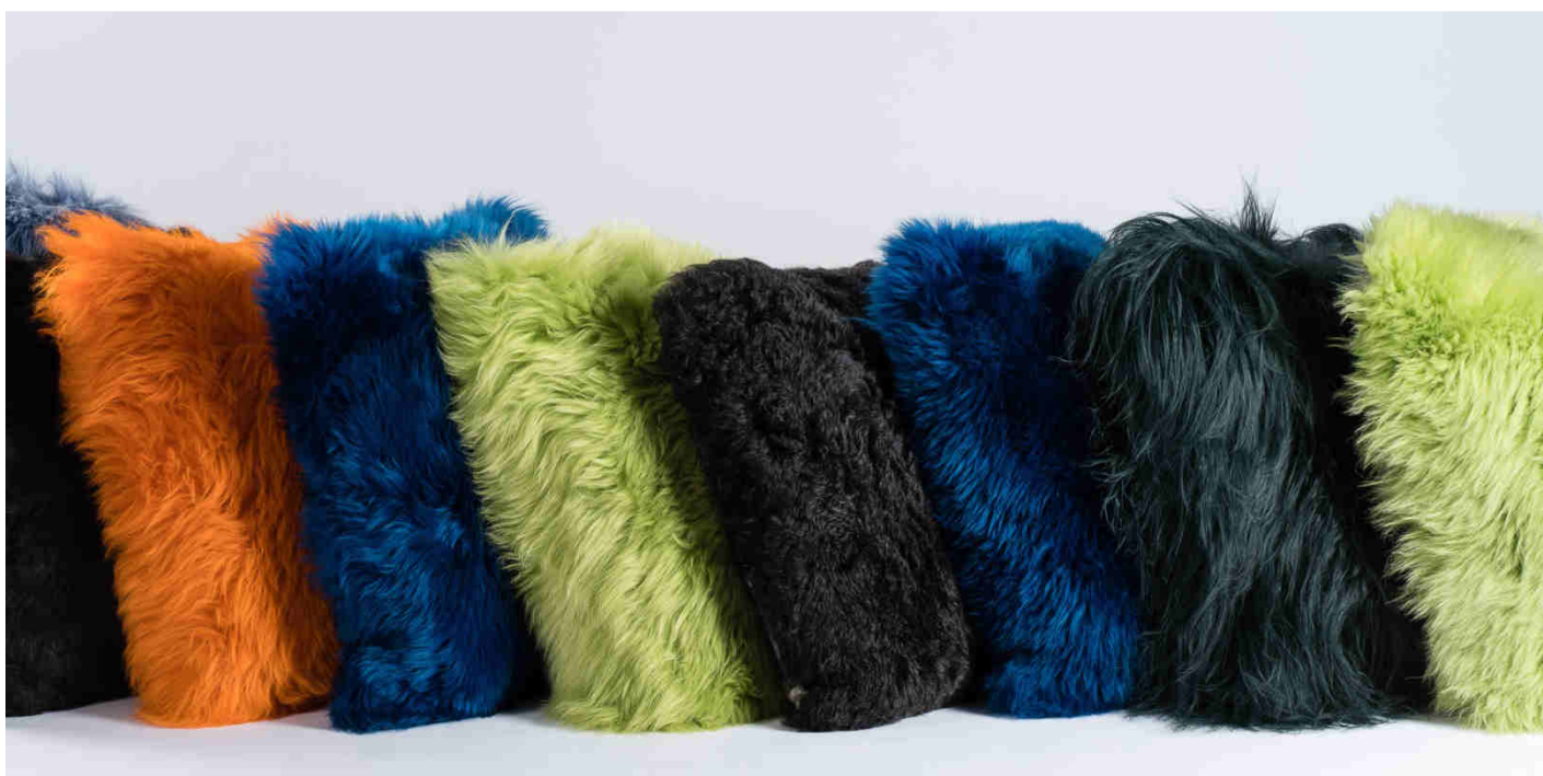
Coussins en mouton 50x50 cm – Sheepskin cushions 1,64x1,64ft